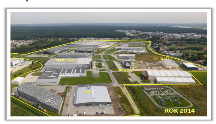
Podkakarpackie Science and Technology Park Aeropolis

Many technological and industrial parks are established in the region and, due to their well-developed technical infrastructure and various forms of support offered by their managing institutions, they are attractive places to invest. More information about the parks is available on: