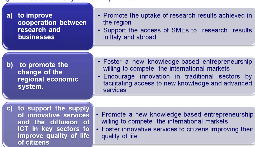
Figure 4 –S3 Umbria Objectives and priorities

The identification of priorities and the definition of intervention areas implementation measures is under discussion within the regional offices and the New Alliance for development.