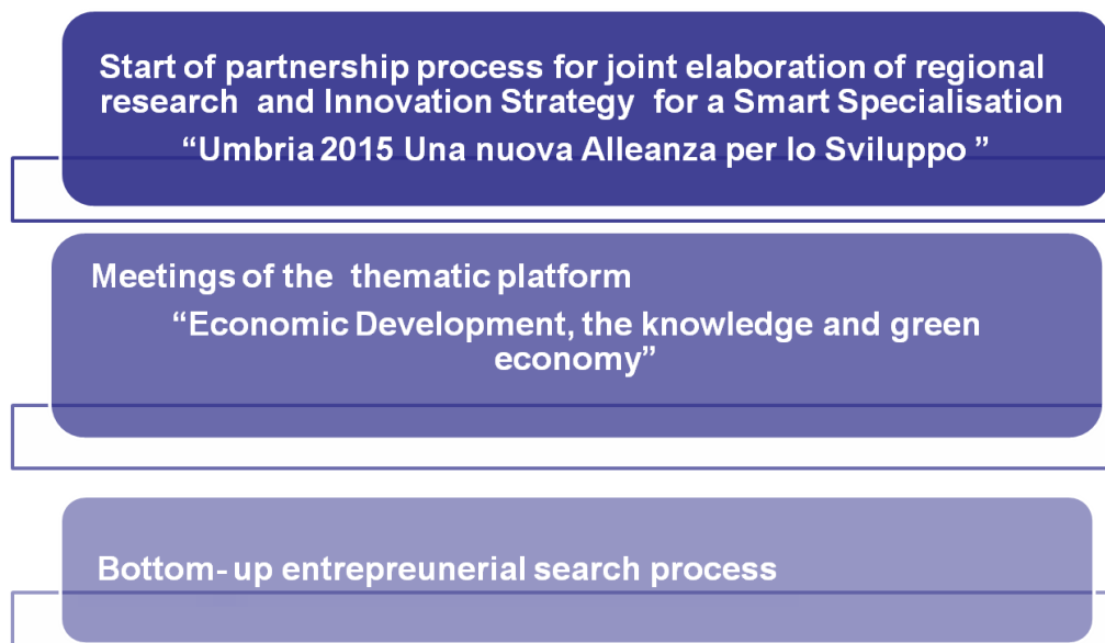
Figure 3 - RIS3 Stakeholders engagement process

The New Alliance For Umbria is the platform through which the regional administration promotes and enhances the participation of citizens, their social groups, representative bodies, territorial and functional autonomies, to programming and identification of objectives and priorities for policy intervention. This in line with the principle of subsidiarity as defined by art. 118 of the Constitution and art. 16 of the Regional Statute.