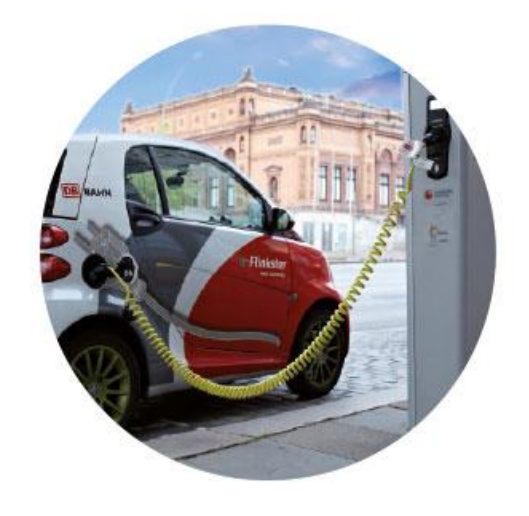
Smart and Efficient Buildings and Cities