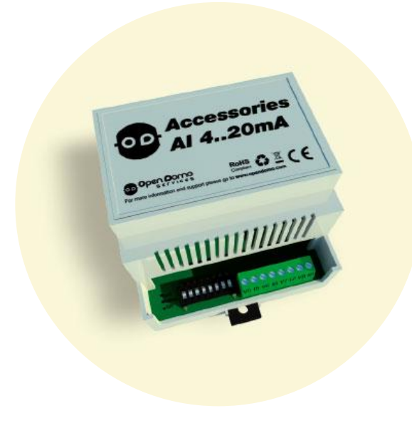
Iberia Smart and Efficient Buildings and Cities