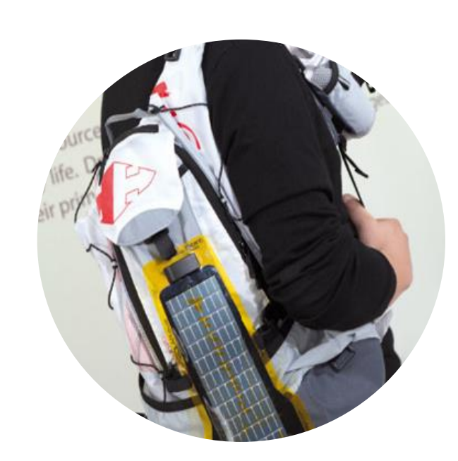
France Renewable Energy