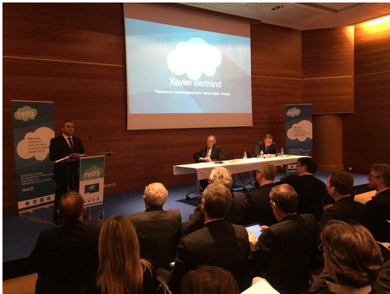
Policy forum – 1 February 2016

New stage for the Third Industrial Revolution: 5 priority directions