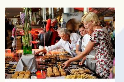
Consumer Involvement in Agri-Food