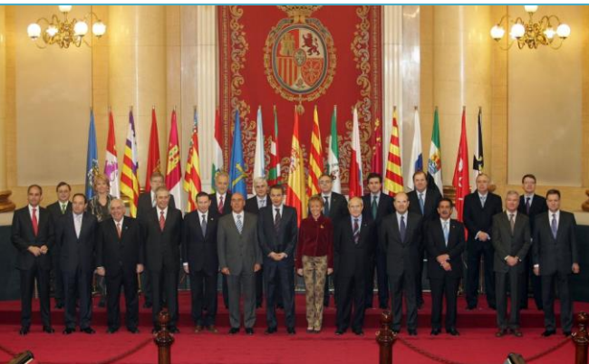
Third Conference of Regional presidents (Jan 2007)