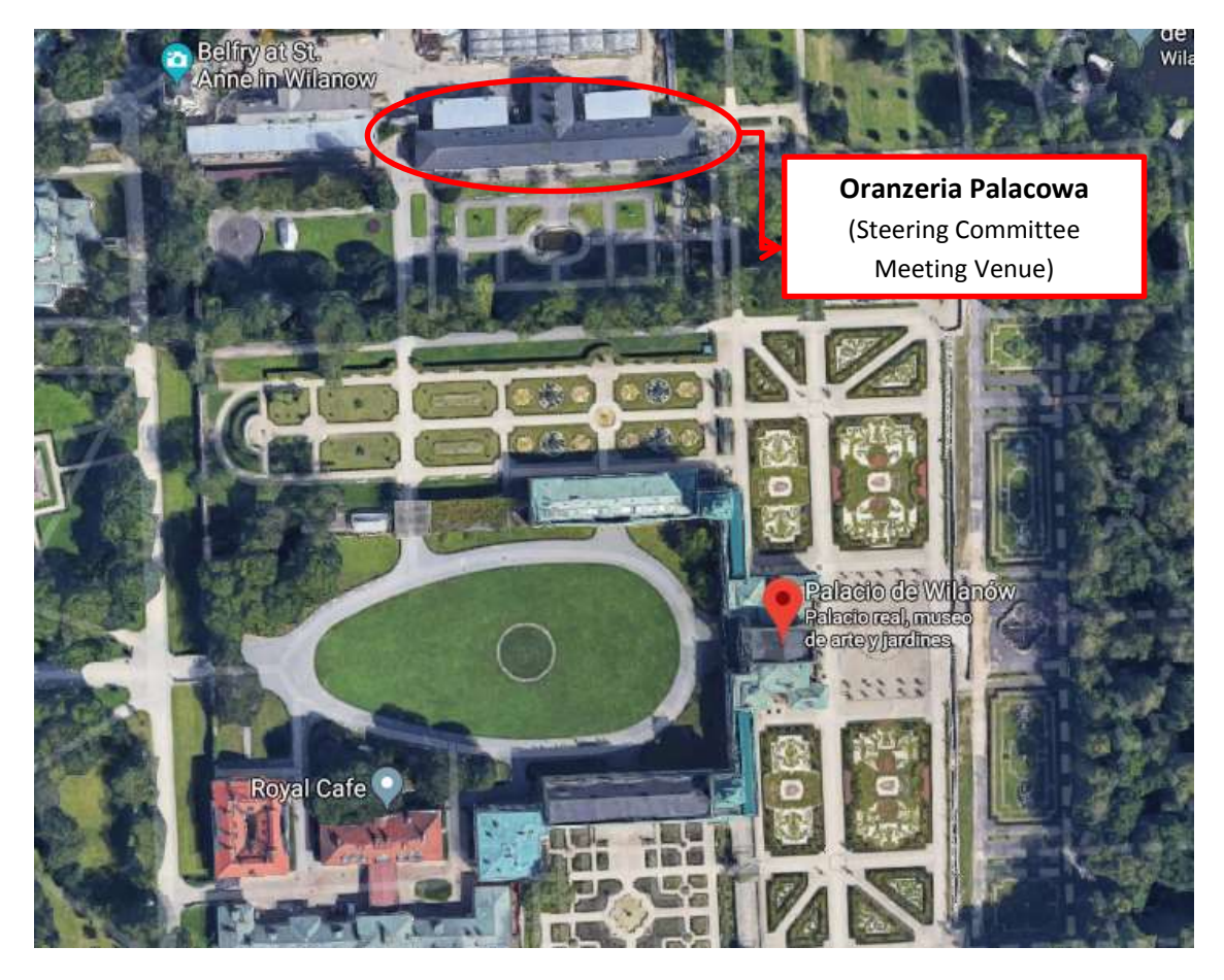
Oranzeria Palacowa – the venue

The venue building (known in Polish as Oranżeria Pałacowa ) is located to the left from the Wilanow Palace.