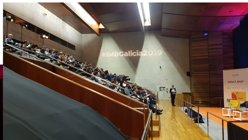
Innovation & Manufacturing Brokerage Event - IMB 2019