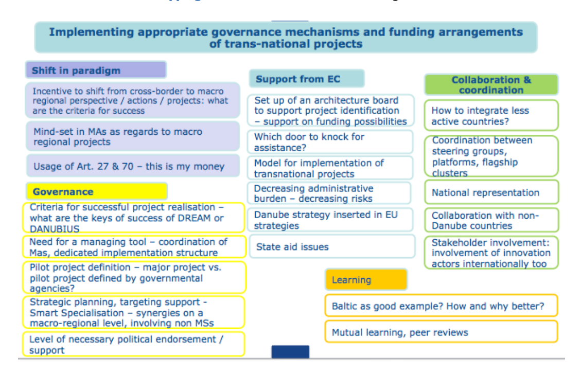
Figure 4. Result of the mind mapping sessions.

Afterwards, a "Pro-Action Café" session was performed as an innovative yet simple methodology for hosting conversations on the concrete questions and issues identified during the previous sessions. It was executed in the form of six round table conversations (see Figure below) between participants on the concrete issues identified during the previous sessions evoking the collective intelligence in pursuit of the common aims.