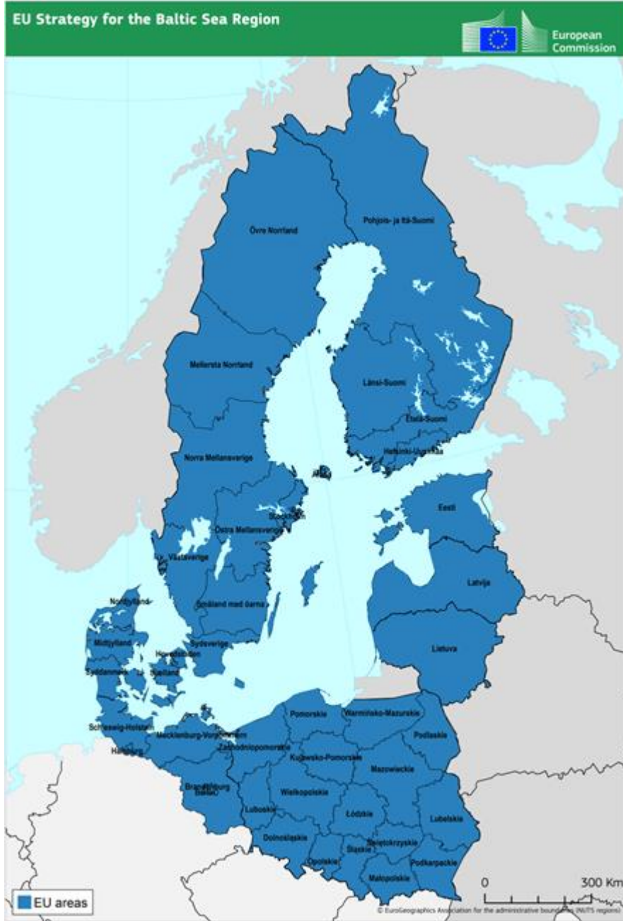
Annex 1: map of the EU Strategy for the Baltic Sea Region