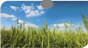
EIT Raw Materials