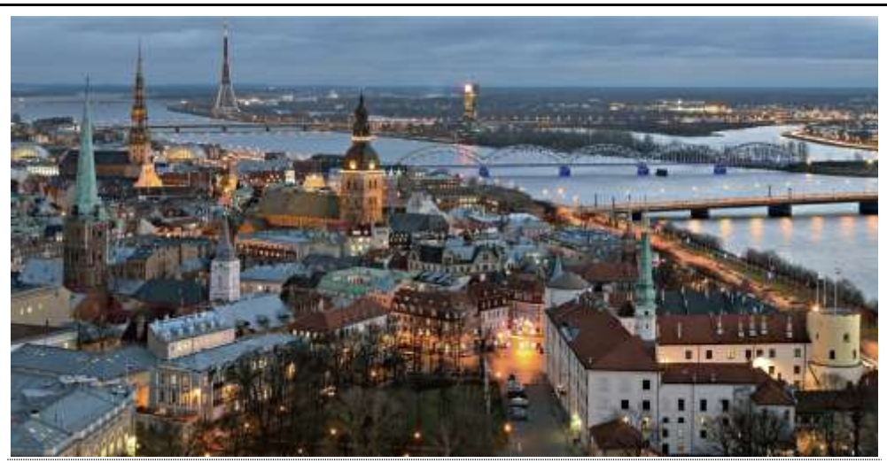
LATVIAN PRESIDENCY OF THE EUROPEAN UNION 2015

Your proposals will serve for the establishment of a repository of cases which will then allow discussing practices applied in order to find possible supporting instruments and measures tackling the bottlenecks of trans-national R&I cooperation. The most inspiring and relevant examples will be selected by the S3 Platform to be presented at various upcoming events organised by the S3 Platform and collaborating partners. The S3 Cooperation survey is available <u>here</u>.