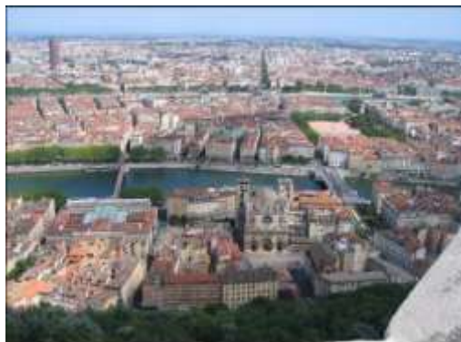
SMART SPECIALISATION WORKSHOP ON FUEL CELLS & HYDROGEN: 22-23/04/2015, LYON, FRANCE

Papers' submissions for CONCORDi 2015 are now open and should be made following the instructions of the Call for Papers document that you can download here .