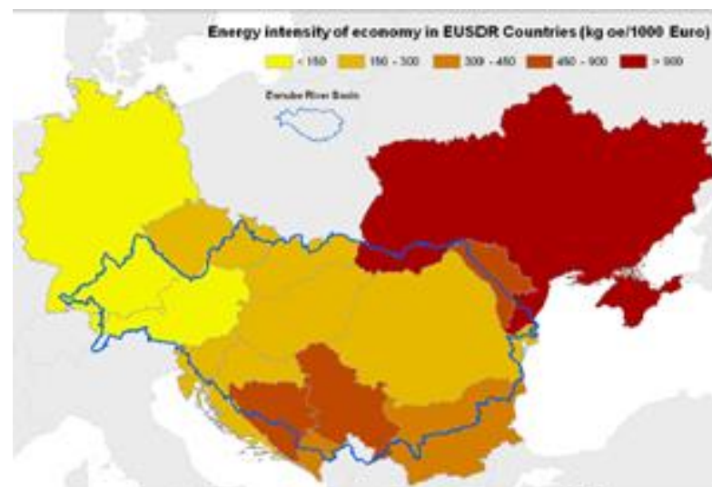
Figure 11. Energy intensity of economy in Danube region countries, 2015 28