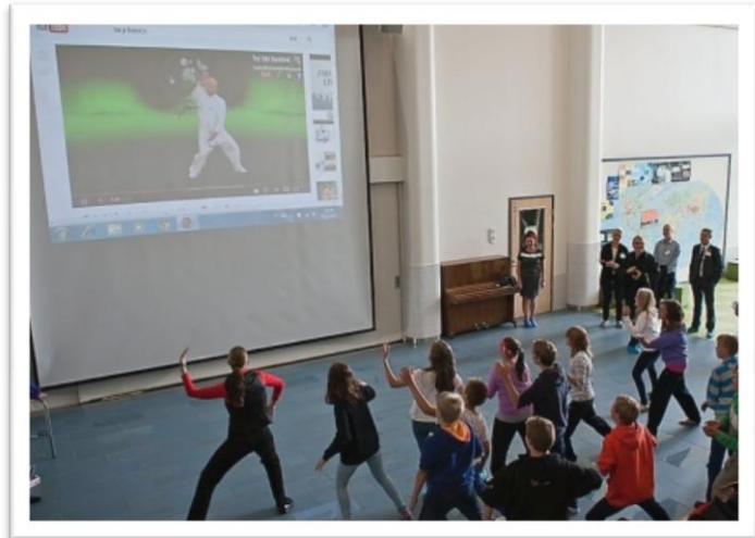
Religion class where Buddhism is the topic of the day and students are learning it by trying Taizé

School Square of Kauhajoki is extremely unique comprehensive school in Finland. The main point of the planning has been to create a learning environment which supports strongly children's eager to learn and respects the differences of the children. The environment of the school square enables different teaching methods to be used. There are different workshops for example for arts and crafts, for sciences and for sense perceptions which enable the learning by mixing different subjects. The joy of learning is developed by working in a concrete way, co-operating and doing research of own environment. For example learning mathematics could be funnier and easier at the same time when you are cooking or doing something by your own hands! It is very important to find students' individual strengths and use them to develop strong self-esteem. They are encouraged to play, move and do exercise by providing them with stimulating environment. Even though the School Square of Kauhajoki is a quite big school in Finland, it does not feel so large because students of various ages can be composed to smaller "village schools". The School Square of Kauhajoki is the first Workshop Village School in Finland!